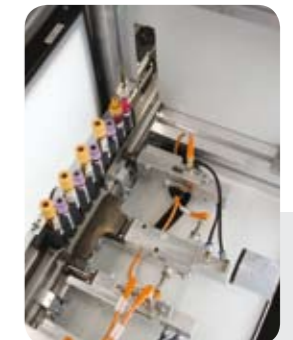
Camera for automatic registration