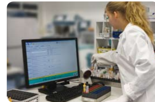
Manual operation supported by software