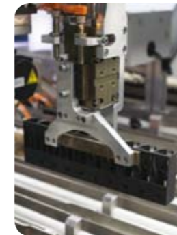
Automated handling of the transport rack