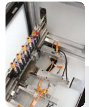
Camera for automatic registration