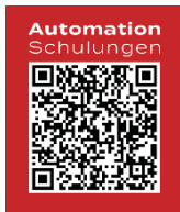
ABB ROBOT TRAINING