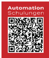
IMAGE PROCESSING BASIC AND MACHINE-SPECIFIC